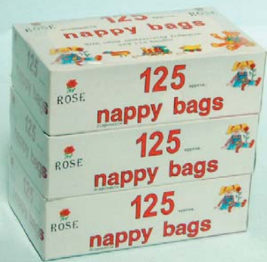
797 Nappy Bags With odour-neutralising fragrance and tie handles 12 x 125 per case