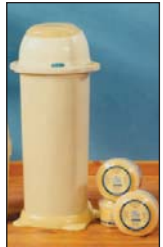
949 Unit 794 refill