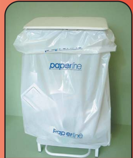
915 Semi Mobile Pedal Operated Sack Holder