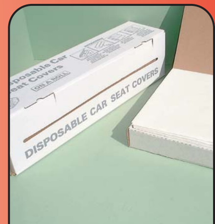
791 Polythene Seat Covers. Fit all makes, roll of 250 799 Paper Floor Mats Box of 250