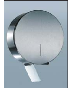
Stainless Steel Dispensers available