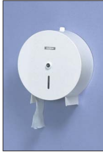
952 Mini/Midi Dispenser (10")