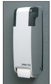
946 Ultima 3 Roll Dispenser