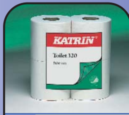
246 2 ply KATRIN White 320 sheet Wrapped in 4's 2 x 36 (72)