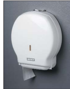
953 Plastic Standard Dispenser

We have Jumbo rolls to fit all makes of dispenser