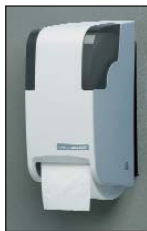
942 Ultima 2 Roll Dispenser