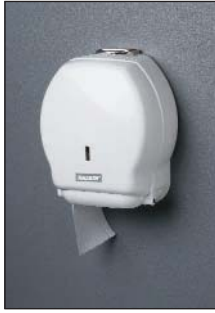
951 Plastic Mini Dispenser