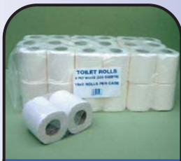
240 2ply White 200 sheet Wrapped in 2's 2 x 36 (72)