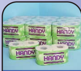
245 2 ply White 320 sheet Wrapped in 2's 2 x 36 (72)