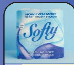
247 2 ply Softy 260 sheets White Wrapped in 4's 9x4 (36)