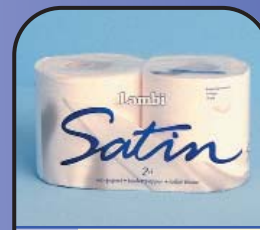
248 3 ply KATRIN White 208 sheets Twinwrapped 2 x 24 (48)